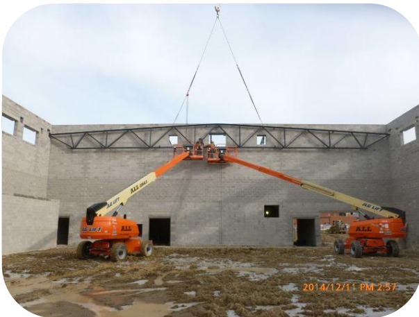
New Middle School Gym Roof Trusses

Our Construction projects continue to move forward. Area “D” of the Middle School, which is the main office, kitchen, mechanical rooms, and locker rooms has been enclosed. Contractors can now work inside that area to install concrete floors, interiors block walls, mechanical equipment, and ductwork. The gym roof trusses have been installed along with the roof decking.